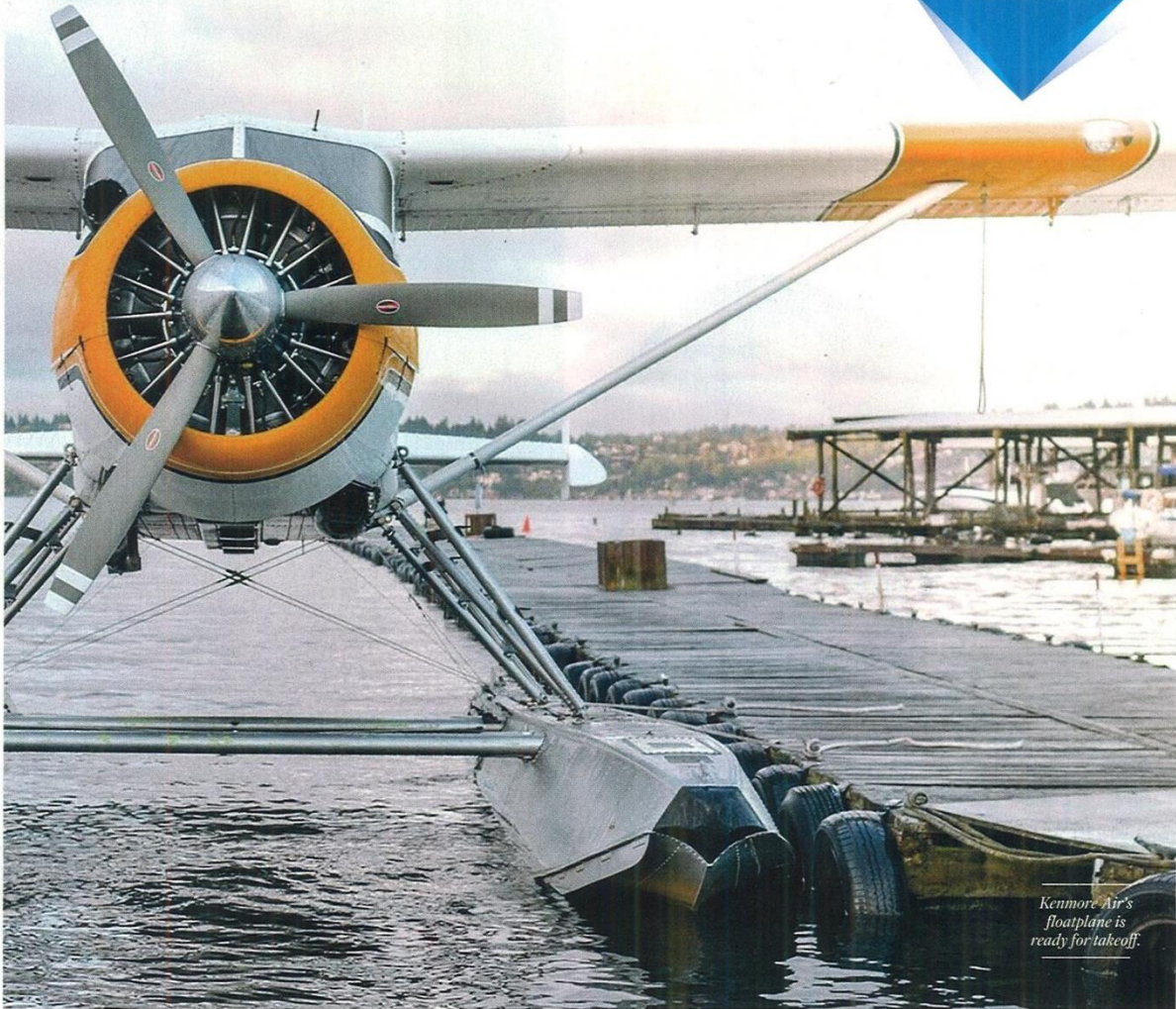
Kenmore Air's floatplane is ready for takeoff.