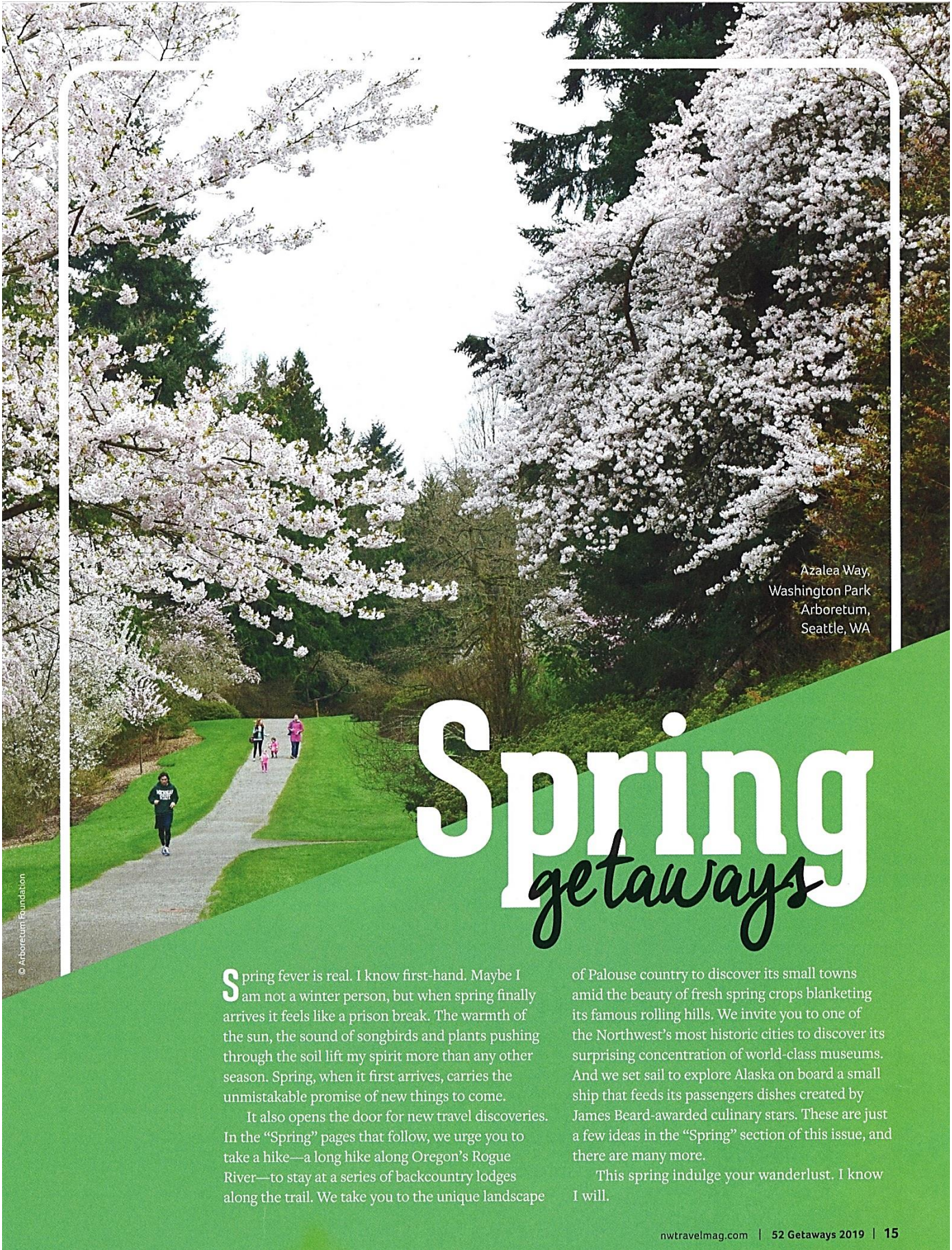
Azalea Way, Washington Park Arboretum, Seattle, WA